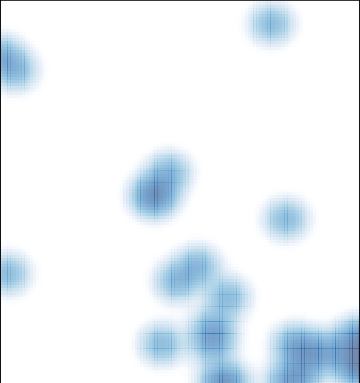
# features = 25 , max = 2